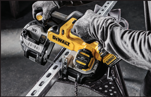
DCS378P1 20V MAX* XR® Mid-Size Bandsaw Kit