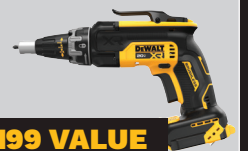
DCF630B 20V MAX* XR® Brushless Drywall Screwgun (Tool Only)